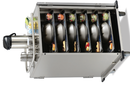
Model SC12S-525DPR with DPR Upgrade Package shown