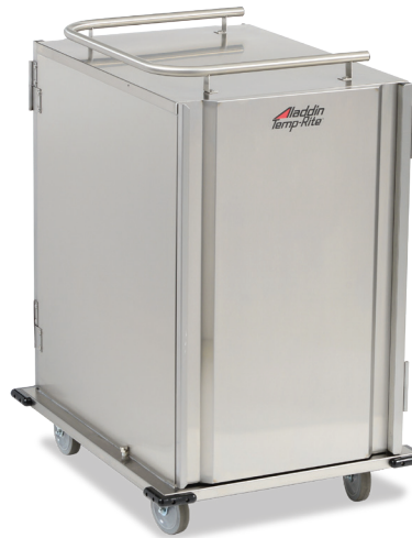
SC12S-525DPR Low-Profile Model with PR Upgrade Package shown