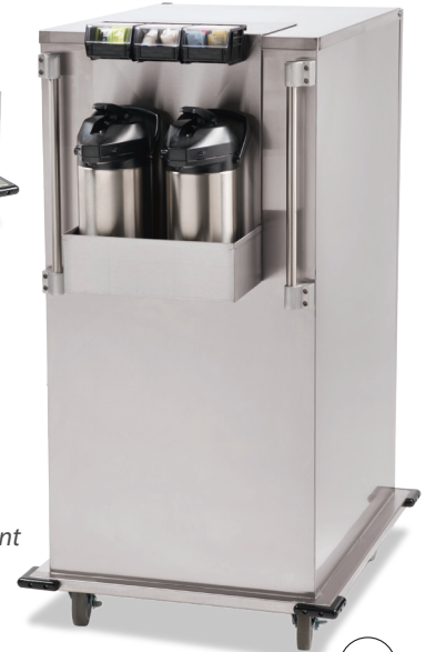
SC16S-525 Model with Beverage and Condiment Caddy shown

New Accessory! On-Board Beverage Caddy Only from Aladdin!